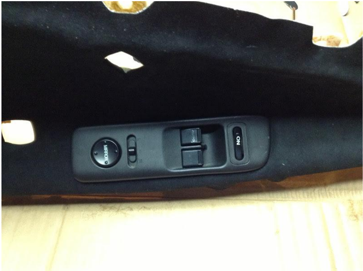
Figure 7 – Test fitting the window controls. I highly suggest you test fit everything so you don't have to go back and make adjustments.