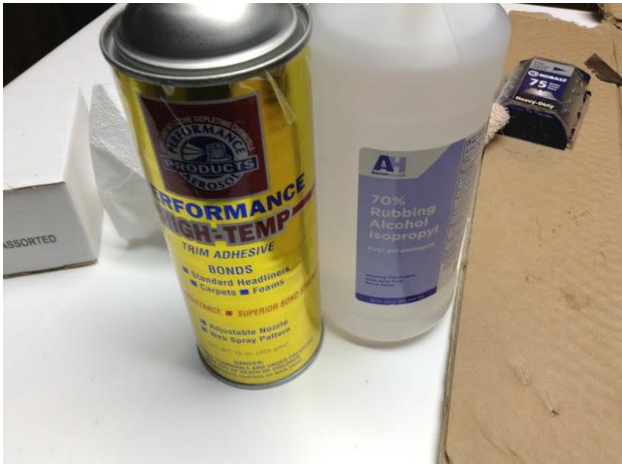
Figure 1 – You need an auto upholstery glue that is designed to withstand high temperatures that your interior is subjected to during summer months

Step 1: Clean the door card surface – Using your rubbing alcohol and lint-free cloth, clean the entire surface of your door card OEM leather to provide a dirt and oil-free bonding surface for the upholstery adhesive. I used standard Isopropyl rubbing alcohol which can be found at your local drug store ( Figure 1 ).