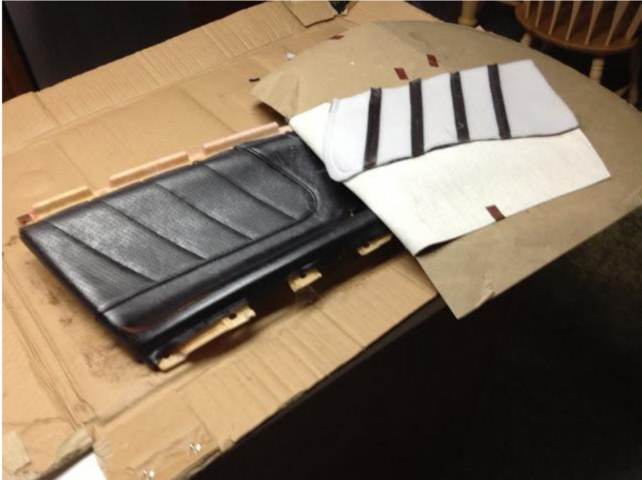
Figure 2 – Note the cardboard sheet I used to protect the “good” side of the fabric from overspray

Step 3: Gluing the front-half of the fabric – Once the rear half has been glued, move on to the front. The process is the same as before but there are a few more complex curves to deal with. Also, the cutouts for the door handle, door latch, and window controls are not cut out of the fabric. You need to make sure to press the fabric securely around the OEM cutouts. In a later step, you will make cutouts in the fabric so all of the door attachments can be reinstalled.