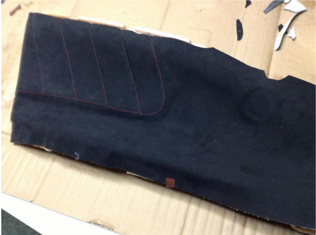
Figure 4 – Press the fabric firmly into all of the contours of the door card. Don't worry too much about the excess fabric, this will be cut later and when the door card is reinstalled to the panel the edges will be held taught