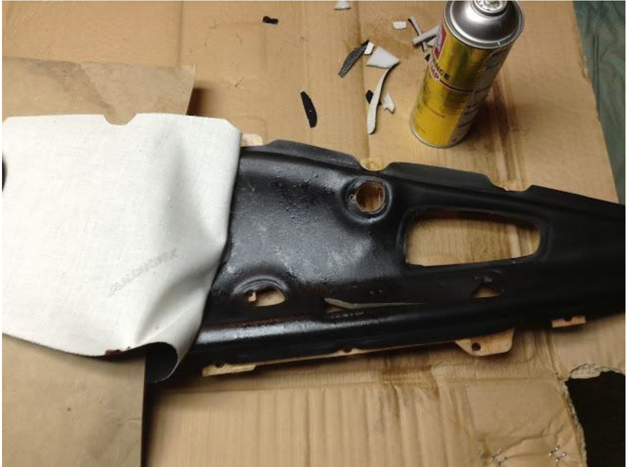
Figure 3 – You can glue the front half all at once or in two sections. Whatever method you choose it is important you press the fabric firmly around all of the contours