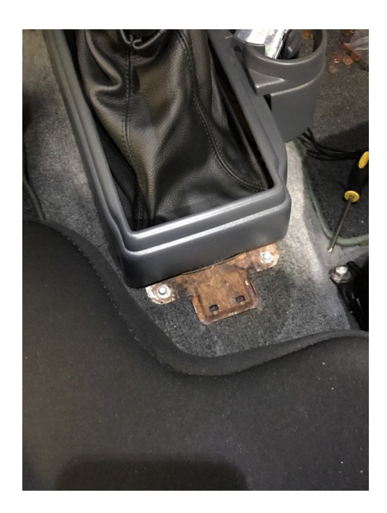
There are 4 screws holding down the center console, 5 if you have the side cup holder. Remove screws to remove console