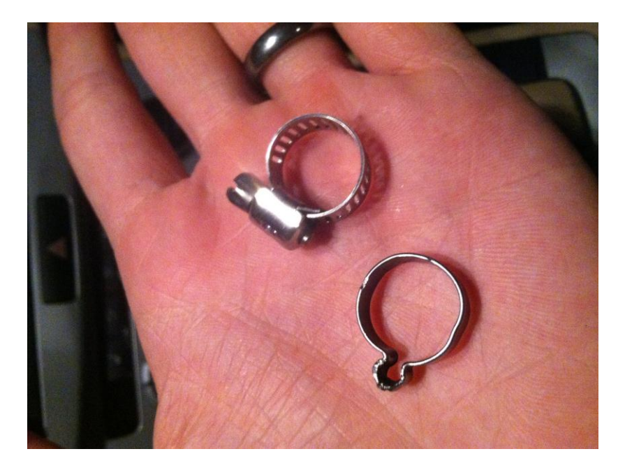
6. Go to home depot to buy the smallest hose clamp ($1.7) to replace the metal ring.