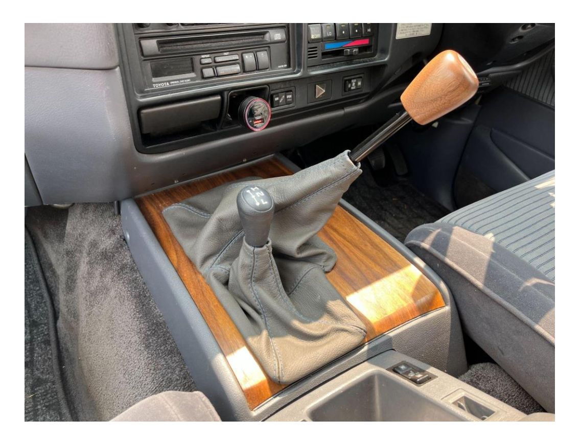
Congratulations – and enjoy your new shift boot from RedlineGoods!

6. Return the console to the vehicle and place it over the shift levers. Resecure the console with the four Phillips screws. Screw the gear shifter and transfer case knobs back on.