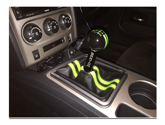
<u>Be patient with installation! Take your time, and only have to do it once. With</u> <u>proper care and leather treatment, this product will last the lifetime of your</u> <u>vehicle!</u>